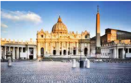
St. Peter's Square, the Vatican