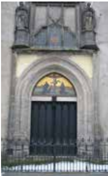
Castle Church Door, Wittenberg, Germany

“The grand principle maintained by ... Reformers—‘the same that had been held by the Waldenses, by Wycliffe, by John Huss, by Luther, Zwingli, and those who united with them—was the infallible authority of the Holy Scriptures as a rule of faith and practice. They denied the right of popes, councils, Fathers, and kings, to control the conscience in matters of religion.