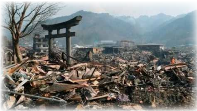
2011 EARTHQUAKE, NAGASAKI, JAPAN

10. Of what may God's children be assured, both now and at Christ's coming? Psalm 37:39, 40; Isaiah 25:9.