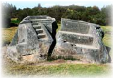
Quarried and transported stones at Sacsahuaman, Peru