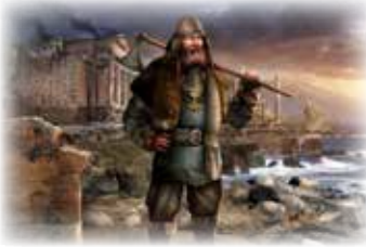
GENSERIC, KING OF THE VANDALS

“And the second angel sounded, and as it were a great mountain burning with fire was cast into the sea: and the third part of the sea became blood; And the third part of the creatures which were in the sea, and had life, died: and the third part of the ships were destroyed.” Revelation 8:8, 9.