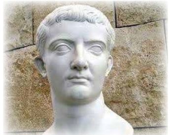
ODOACER, FIRST, BARBARIAN KING OF ITALY

This angel is another heavenly messenger who announced that the three remaining trumpets would be woes, because of the terrible events to take place. Therefore, the fifth trumpet is the first woe, the sixth trumpet is the second woe, and the seventh trumpet is the third woe.