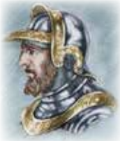
ALARIC, KING OF THE GOTHIS

The first trumpet presented events at the close of the fourth century, when the Roman Empire was invaded by the Visigoths (Goths). Under Alaric, the Goths captured the famous cities and put many of the people in bondage. The city of Rome was destroyed by these barbarians in A.D. 410.