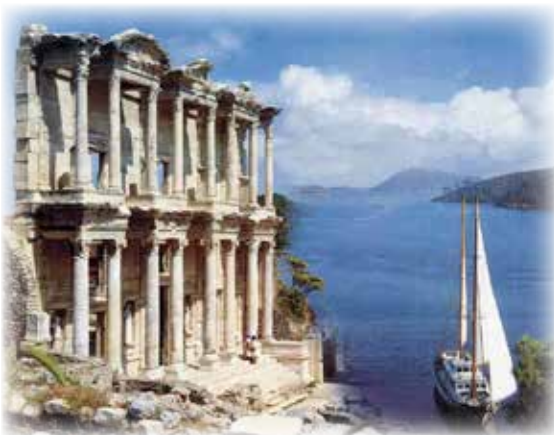
Coast of Ephesus

12. What is promised to the overcomer? Revelation 2:7.