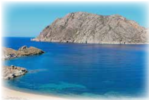
Isle of Patmos