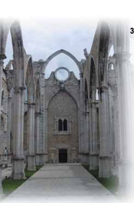
A building that survived the Lisbon earthquake